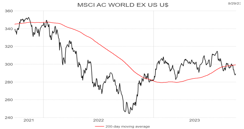
Data daily as of September 29, 2023. Charts shown for illustrative purposes. Not indicative of RiverFront portfolio performance. Index definitions are available in the disclosures.