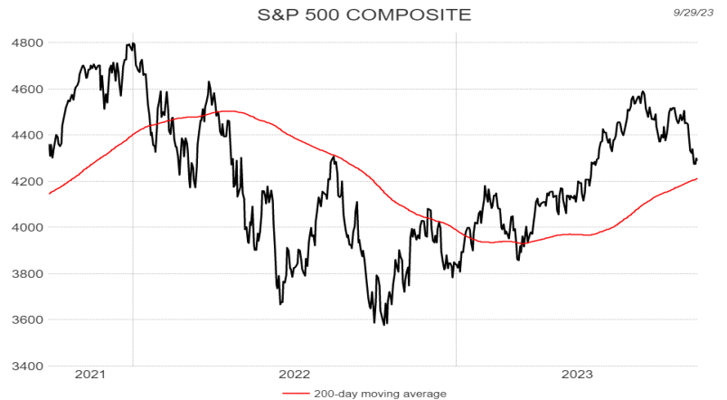
Source: LESG Datastream, RiverFront. Data daily as of September 29, 2023. Charts shown for illustrative purposes. Not indicative of RiverFront portfolio performance. Index definitions are available in the disclosures.