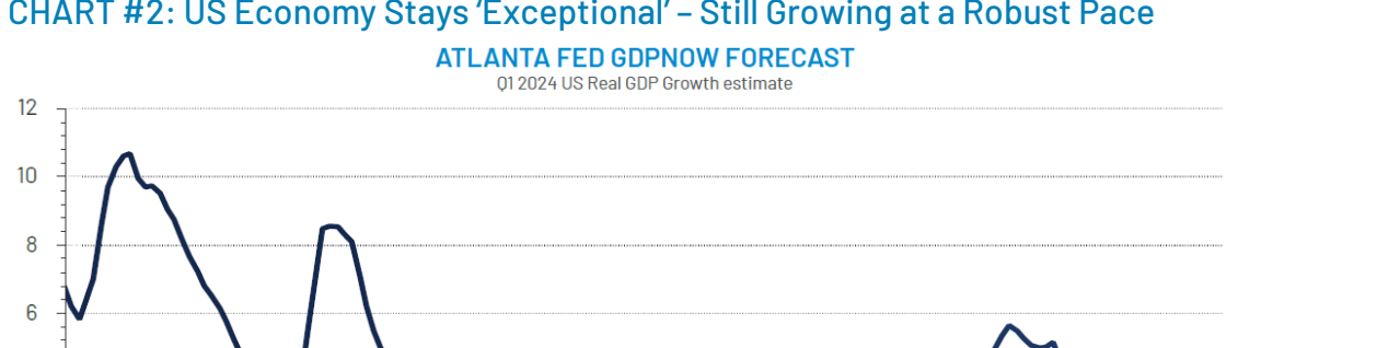
CHART #2: US Economy Stays 'Exceptional' - Still Growing at a Robust Pace

Chart shown for illustrative purposes only.